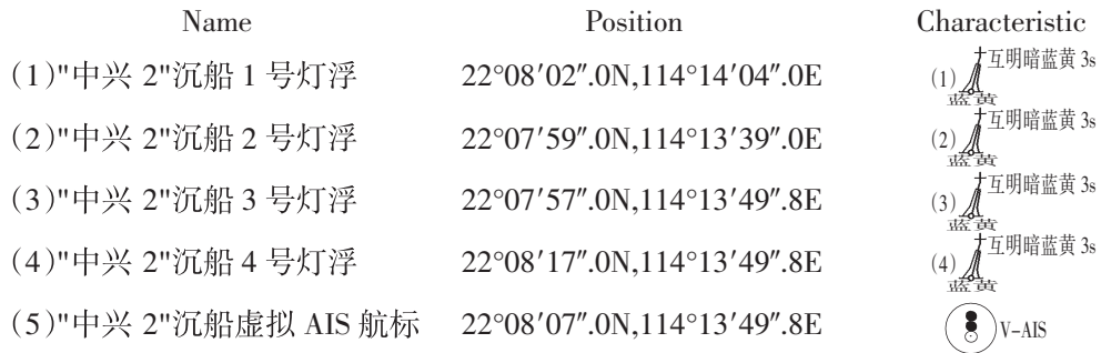
Chart 83001(with chart unchanged)[2014-639] 84001(with chart unchanged)[2014-639] 84203(with chart unchanged)[2014-639] 3314(with chart unchanged)[2014-639]

Insert emergency wreck marking buoys and V-AIS in the following position: